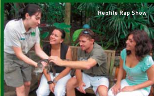
Reptile Rap Show