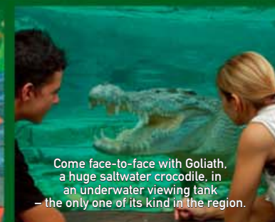
Come face-to-face with Goliath, a huge saltwater crocodile, in an underwater viewing tank – the only one of its kind in the region.