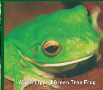
White Lipped Green Tree Frog