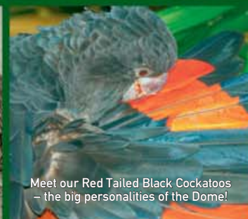
Meet our Red Tailed Black Cockatoos – the big personalities of the Dome!