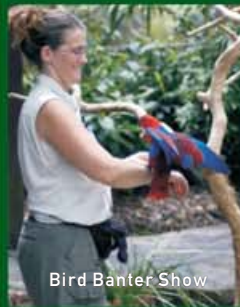
Bird Banter Show