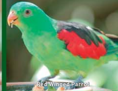
Red Winged Parrot