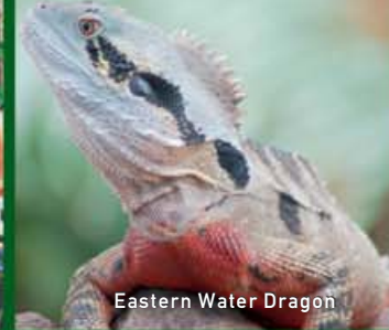
Eastern Water Dragon