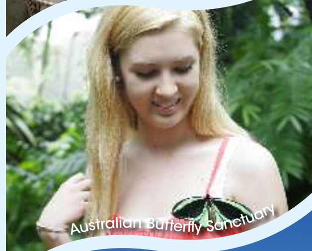
Australian Butterfly Sanctuary