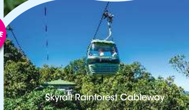
Skyrail Rainforest Cableway