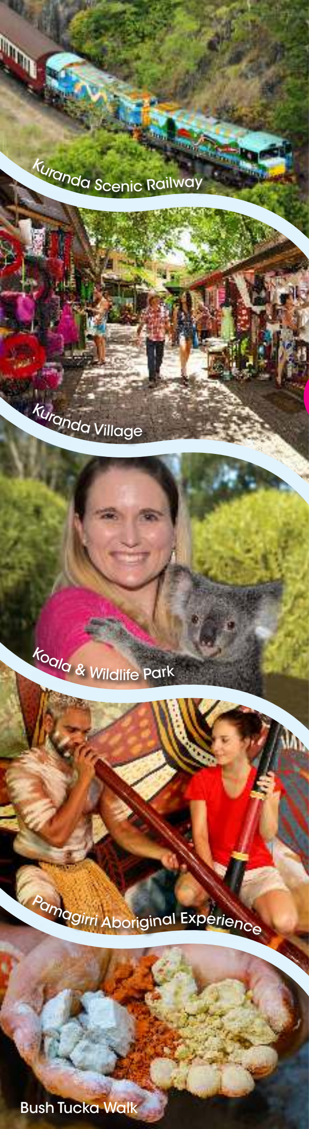
Kuranda Scenic Railway