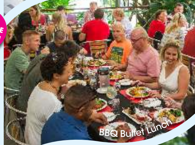
BBQ Buffet Lunch