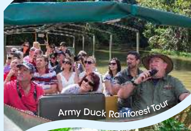
Army Duck Rainforest Tour