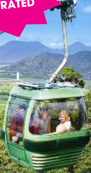
Skyrail Rainforest Cableway