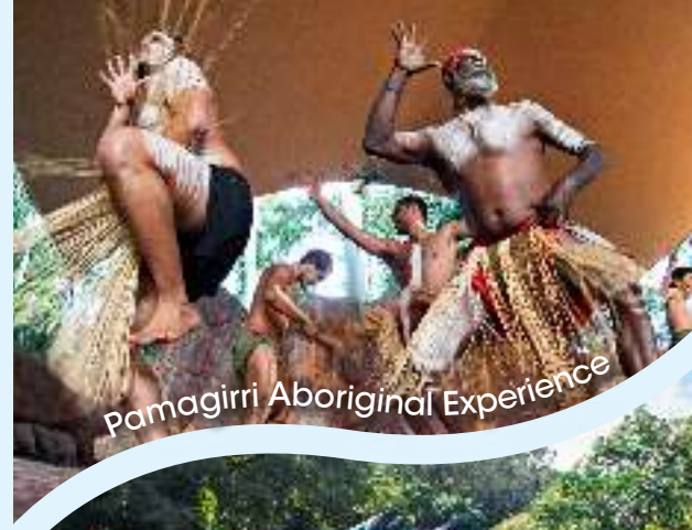
Pamagirri Aboriginal Experience