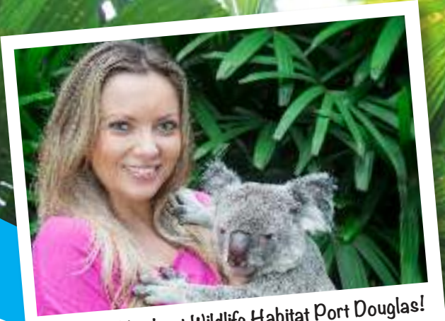
Cuddle a Koala at Wildlife Habitat Port Douglas!

Departs: Approx 7:30am from Cairns & 8:15am from Port Douglas. Returns: Approx 7:30pm to Cairns and 6:30pm to Port Douglas. *Tours operate daily except 11/06/17 & Christmas Day.