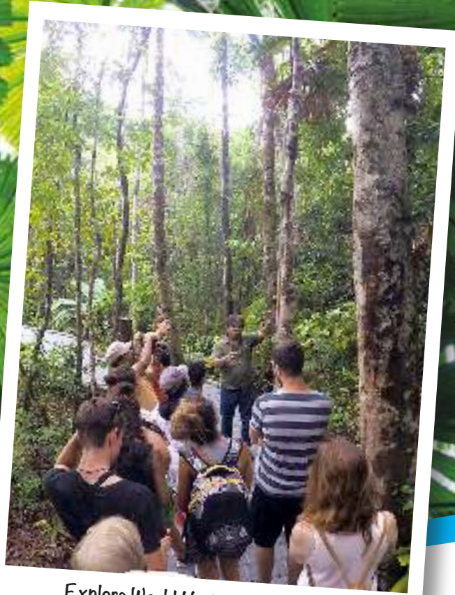
Explore World Heritage Rainforest!