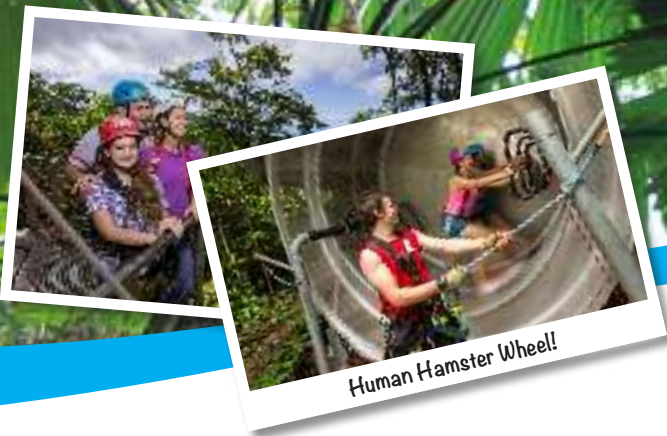
Human Hamster Wheel!

*Tours operate daily except 11/06/17, Christmas Day and New Year's Day