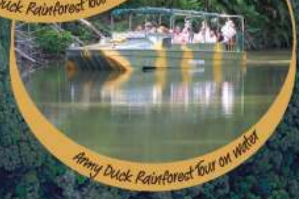
Army Duck Rainforest Tour on water