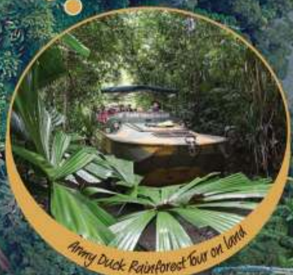
Army Duck Rainforest Tour on land