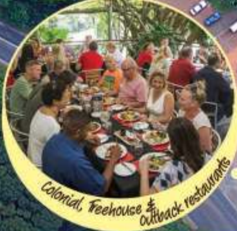
Colonial, Treehouse & Outback Restaurants