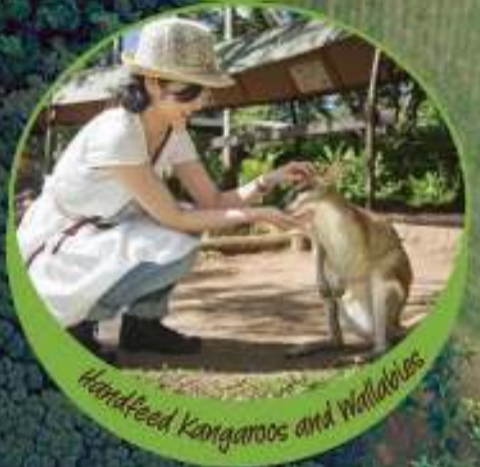
Hand-feed Kangaroos and Wallabies