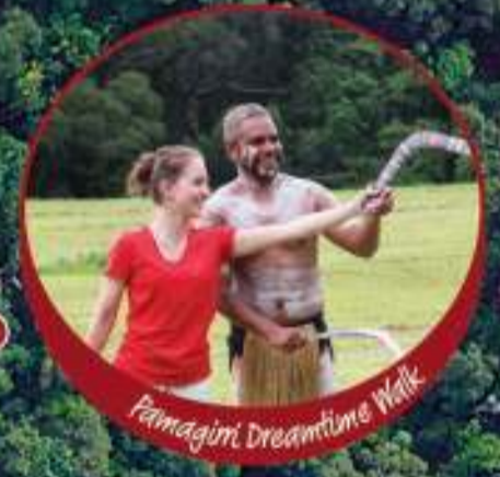
Pamagiri Dreamtime Walk