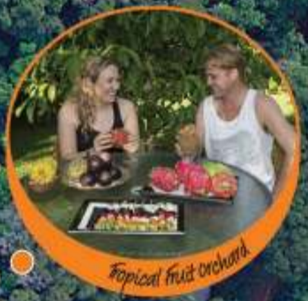
Tropical Fruit Orchard