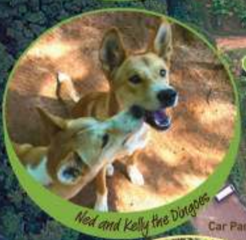
Ned and Kelly the Dingoes