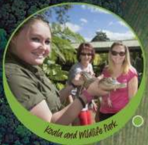
Koala and Wildlife Park

All times are approximate and subject to change.