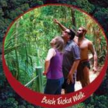
Bush Tucker Walk

Our restaurants can accommodate exclusive small or large functions, incorporating all of the park's attractions for a memorable event.